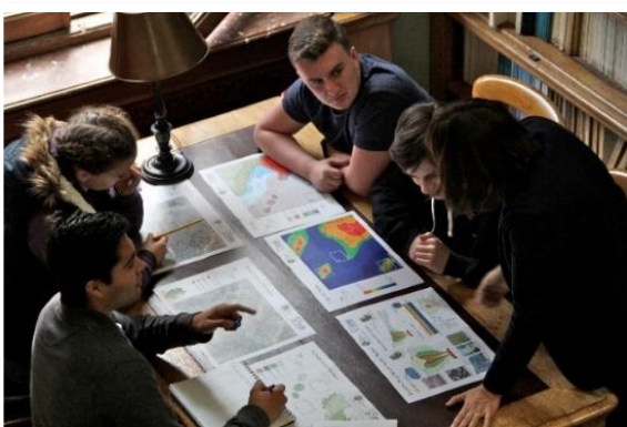
Students search for copper in a desk activity at the Geological Society.

More broadly, the qualification develops expertise useful across higher education, such as the ability to cite references correctly, use relevant statistical methods when evaluating data (such as Mann Whitney U and Spearman's rank correlation coefficient) and use a variety of on and offline research techniques.