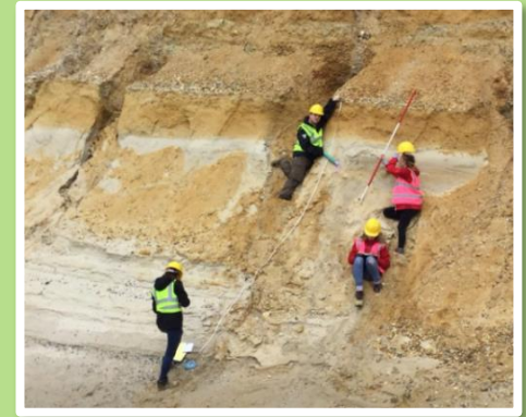
Year 12 students learning field skills at Highwood Quarry

Year 12 - One day fieldwork at Highwood Quarry, a local aggregate quarry. Here, the students learn how to describe sedimentary rocks in the field, undertake a graphic log, study unconformities and interpret sedimentary environments. The visit also introduces aspects of economic geology. A second day involves studying coastal exposures at Walton on Naze, Essex. Here, students study contrasting sedimentary environments, allowing development of field sketching skills, and the description and identification of fossils in situ .